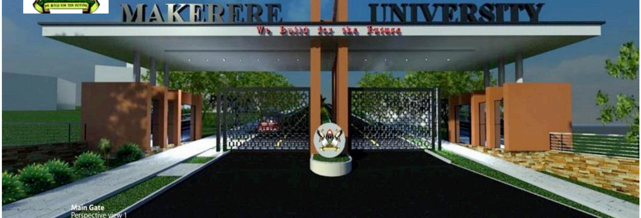
Main Gate Perspective view 1

Strengthening public universities to generate knowledge and promote research uptake for national and regional development